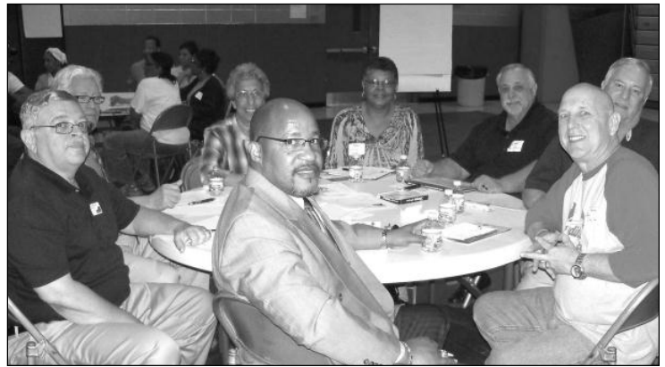
Discussion group from the City of BN, Glasgow and Spanish Lake.

The North St. Louis County Planning area includes The City of BN, Village of Riverview, Glasgow Village and Spanish Lake. The first meeting for this area was held on March 20, 2012, at Trinity Catholic School with more than 120 residents attending. At the first meeting, the group was asked to identify the