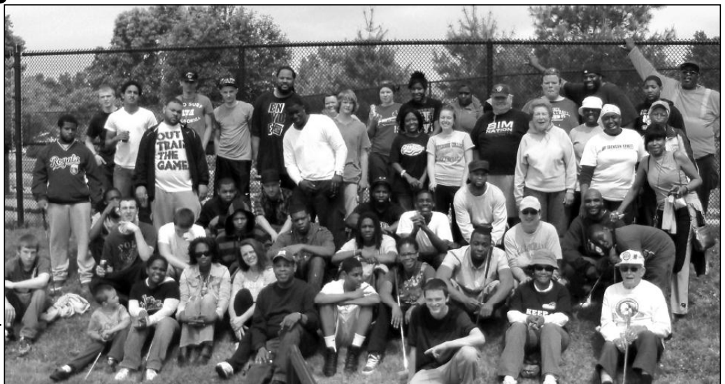
The 2012 Beautification Action Day Team

After the work was done, volunteers had hot dogs, hamburgers, chips, cookies, soda and tried out the mini golf course.