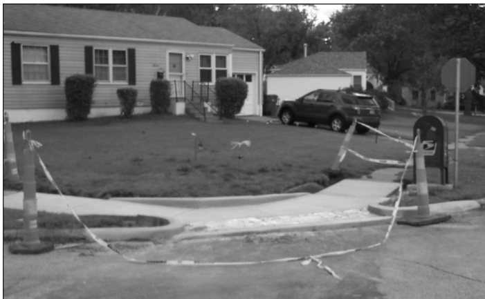
Coburg Lands at Cabot, handicap accessible sidewalks.

Construction and repaving on Coburg Lands Drive and Belgrove Drive is underway and expected to be completed by the time this newsletter is delivered. The sidewalks on Coburg Lands are being upgraded to accommodate the handicapped. Coburg Lands will be milled and new asphalt will be laid from Chambers Road to Bellefontaine Road.