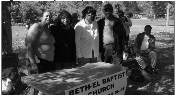
Members of Beth-El Baptist Church

In honor of the City's 63rd Anniversary, the St. Louis County Parks Department opened the Bissell House for free tours and 80 people took advantage to see this beautiful museum and what life was like in the early 1800's.