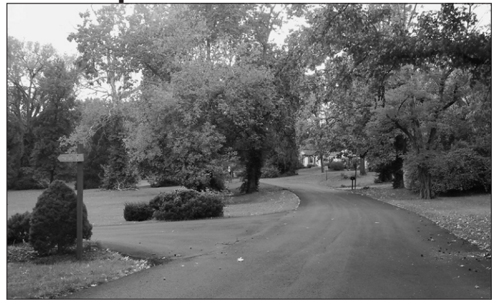
Green Acres Road

Residents in Green Acres are riding much more comfortably now since the roads got milled and replaced this September. The residents in Green Acres, a