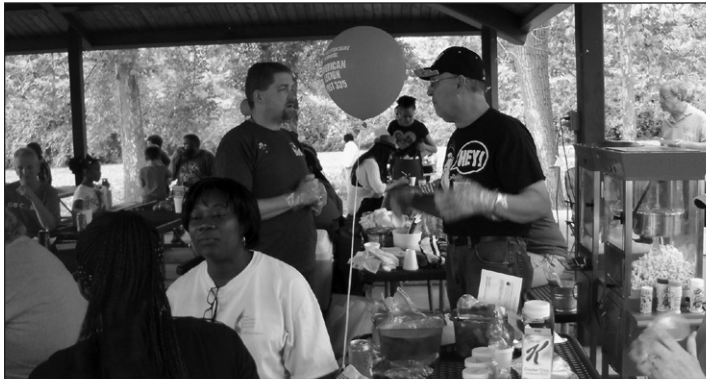
Bellefontaine Baptist greets picnickers

Again, the BN Community came together. This time for a picnic in the park. The City of BN, Neighborhood Churches, Not-for-profit organizations and many individuals came through to bring residents and church members together for a laid-back day in the park. Riverview Gardens School District's Gentlemen of Vision, The Riverview Senior High School Choir and Leadwork Urban Music group, sponsored by Mathews-Dickey, provided entertainment and amazed the picnickers of the positive energy of our youth.