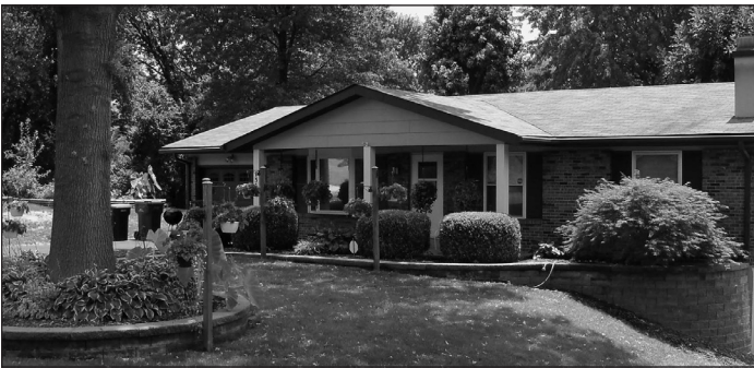
The Eberle Home 1368 Shepley