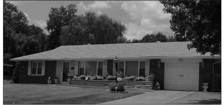
The Crosby Home 9947 Northampton