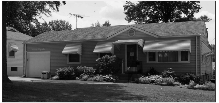
The Kondracki Home 1136 Hoyt