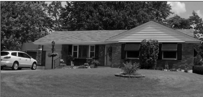
The Poellnitz Home 1131 Dunford