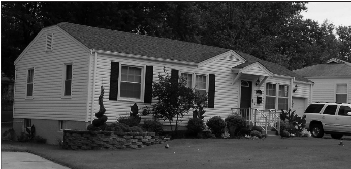
The Faulkner Home 1237 Hoyt