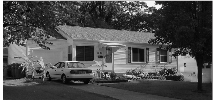
The Hoffman Home 1246 Roxton