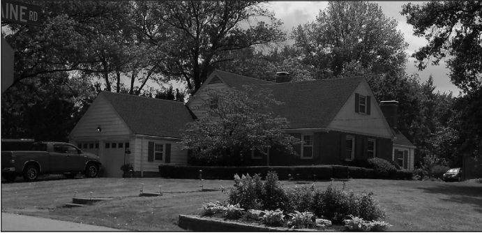
The Dozier Home 9840 Bellefontaine