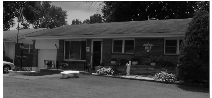
The Martin Home 920 Lebon